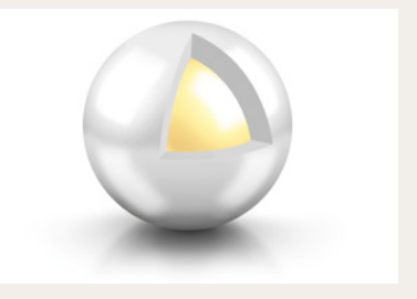
A combination product based on two existing monographs to reduce regulatory risk

EUDRAGIT® FL 30 D-55 utilizes Evonik's new, patented AEMP<sup>TM</sup> (Advanced Excipient Manufacturing Process) technology to unite the respective benefits of two polymers with well accepted monographs including EUDRAGIT® L 30 D-55: the gold standard for enteric coatings since 1955. Compatible with virtually all APIs and creating benefits for multiparticulates and other dosage forms, EUDRAGIT® FL 30 D-55 sets a new platinum standard for enteric coatings.