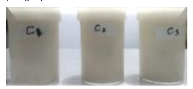
Figure 2. Snail slime emulgel (Formula C as best formula)

This test was carried out for 6 cycles and the most stable formula C was produced, compared to 2 other formulas. This was indicated by the unchanged preparation after passing 6 cycles.