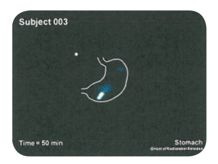
DRcaps capsule starts to release the contents