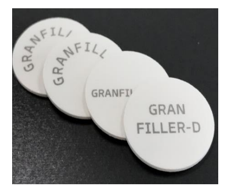
Fig. 4 Imprinted coin-shaped ODTs

The following is a discussion of the coin-shaped ODT as a special dosage form also suitable for children. Coin-shaped ODTs are large in diameter, at approximately 14 mm, and thin, with a thickness of \leq 1 mm (Fig. 4). Because of their large surface area, they have the ability to disintegrate very rapidly. The coin-shaped ODTs described in this article were produced with GRANFILLER-D. The composition of the tablets and the tableting conditions are provided in Table 2.