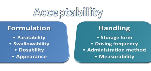
Fig. 1 Factors required for pediatric formulations

There is strong clinical need for pediatric formulations from healthcare professionals and caregivers since the number of available pediatric formulation is limited. Currently oral administration is the main route of administration for pediatric formulations in the market. For development of pediatric oral administration, "acceptability" of "formulation" and "handling" should mainly be considered. Particularly, the formulation is the most important because it includes palatability (e.g., taste, smell and texture) and swallowability (e.g., size and shape). These two factors determine suitability for of taking medications to children (Fig. 1).