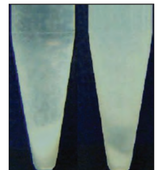
Super Refined PEG 400 - lots A & B