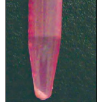
Super Refined PEG 400 NF