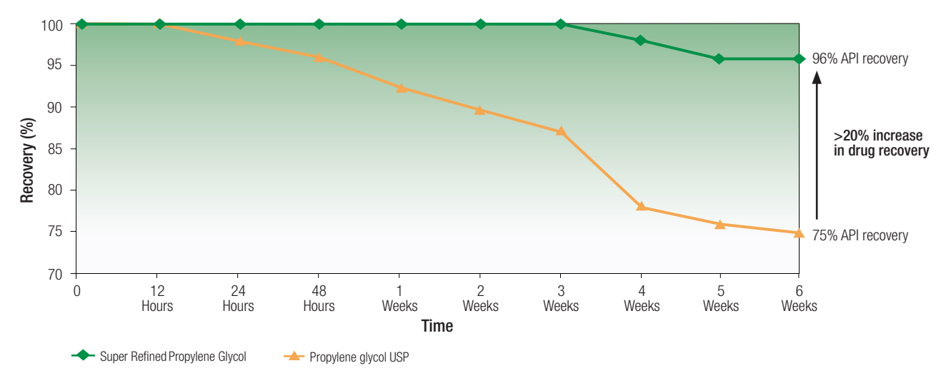
Figure 1: Comparison of perphenazine recovery in Super Refined Propylene Glycol as compared to propylene glycol USP over a 6 week period at 50°C.

Using Liquid Chromatography-Mass Spectrometry (LC-MS), it can be seen (Figure 1) that the perphenazine in Super Refined Propylene Glycol exhibited only a 96% drug recovery while the same API in propylene glycol USP exhibited only a 72% recovery. The study clearly demonstrates that Super Refined Propylene Glycol improves drug stability of the API over USP grade propylene glycol.