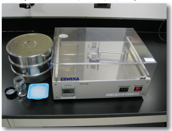
Figure 1. Oscillating Friability Apparatus (Erweka GTA 120, Milford, CT, USA)

Sugar spheres of 20/25 mesh (710-850µm, Suglets<sup>®</sup> PF010, Colorcon Inc., USA) were used as the substrate. Laboratory friability testing of the sugar spheres was performed using a modified methodology based on Eur. Ph. 2.9.41, Method B. The equipment used is shown in Figure 1.